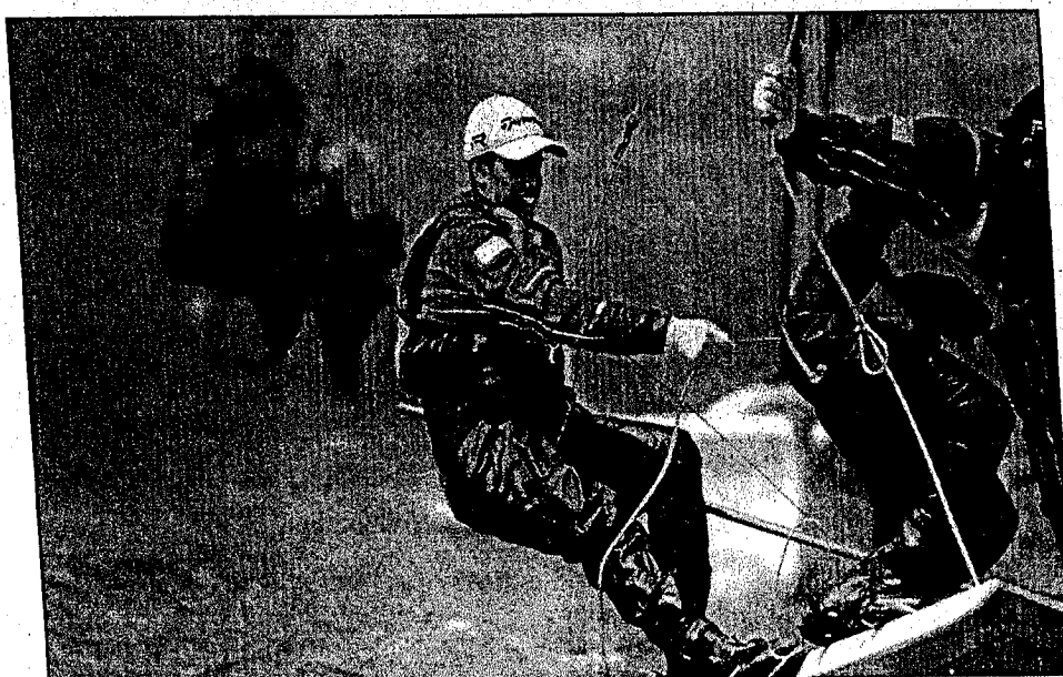
India International Regatta - 2016